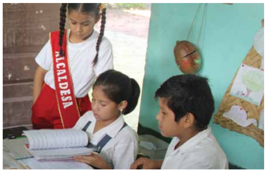
Student government president working with classmates in an Active School in Peru