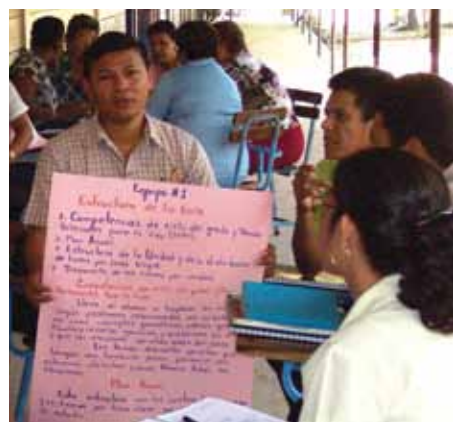
Teachers developing learning guides in Nicaraguan ILC

with the isolation of rural life. The ILCs strengthen solidarity and camaraderie and help participants to take seriously a training process that acknowledges each teacher with his or her own history, potential, and weaknesses.