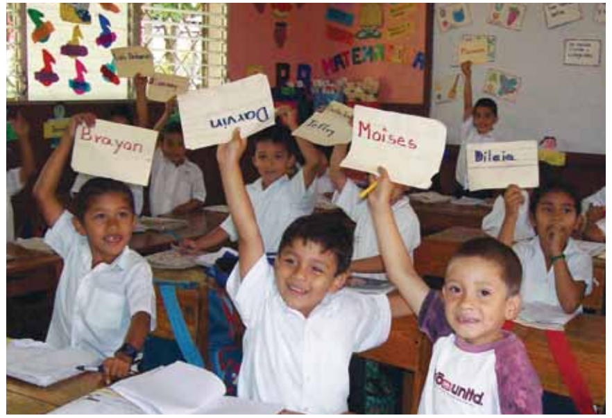
Children learning to write their names in Nicaragua

The approach to learning to read and write. The Active School approach to learning to read and write is based on the principle that when children start first grade they bring with them things they have already learned in family and social settings that must be taken into account for enriching or completing the learning process. At the same time, it ensures that reading is not reduced to decoding, or copying, but rather to producing and interpreting texts. First grade follows the principle that reading and writing should be presented to children intact, just as it appears in their lives—as something natural, useful, and enjoyable.