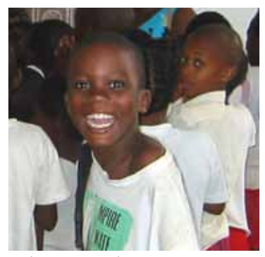
Student in Equatorial Guinea

active multi-grade classroom. With teachers, we look for ways they can reinforce the socialization and upbringing children have already received at home and bring with them to school. We explore ways for teachers to emphasize cognitive-communicative and linguistic competencies that continue children's reading and writing readiness for school. We also include ways to improve children's visual-motor development and motivation to