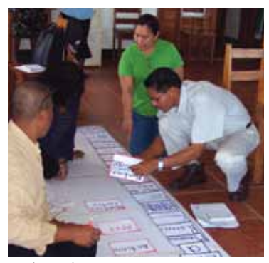
Teacher authors in Nicaragua

become authors are those who think most deeply about their own practice, are the best at handling the multi-grade classroom, make the best adaptations to the process, have managed to turn their schools into model schools, and, in many situations, are the most successful at providing pedagogical accompaniment.