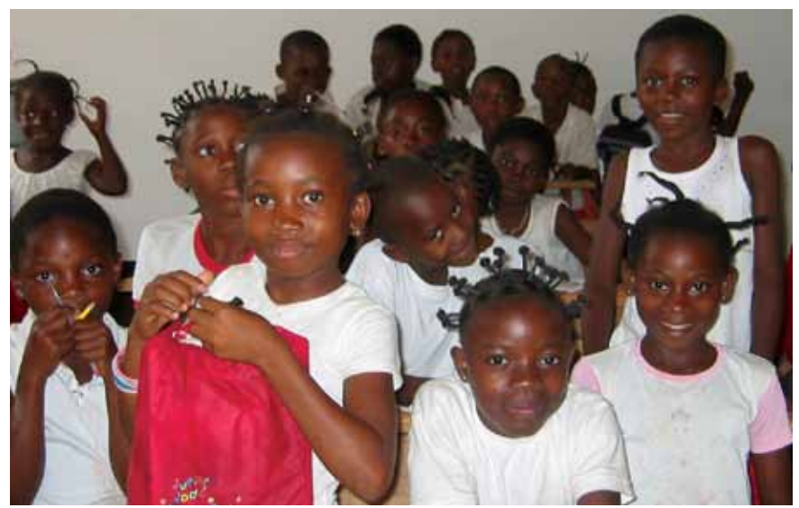
Students in Equatorial Guinea

and their socio-cultural background, but they are not limited to local knowledge; rather, they enable sharing universal knowledge. Knowledge construction through use of the guides is based on the local setting, the village, hamlet, or province, and offers opportunities for learning to learn and being creative and critical. The norms, conduct, and values promoted in the guides strengthen children's sense of equity and responsibility. Once they internalize these principles, children become capable of turning away from the false stereotypes that develop in society and they experience a positive paradigm shift. Values are worked on constantly through experiences.