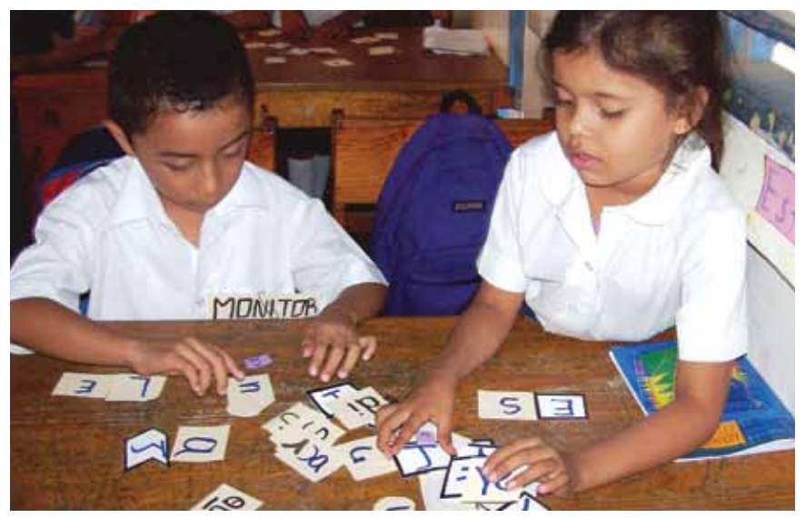
Students working in small groups in Peru

and peaceful social interaction is only possible in the prestigious, elite private schools, which are believed to be the only ones that can offer better-quality educational services.