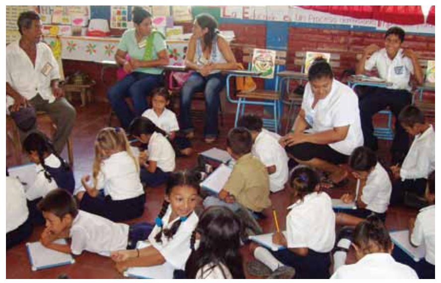
Parents helping children in Nicaragua

External evaluations of projects that implemented the Active School approach agree on the following benefits of parental involvement: