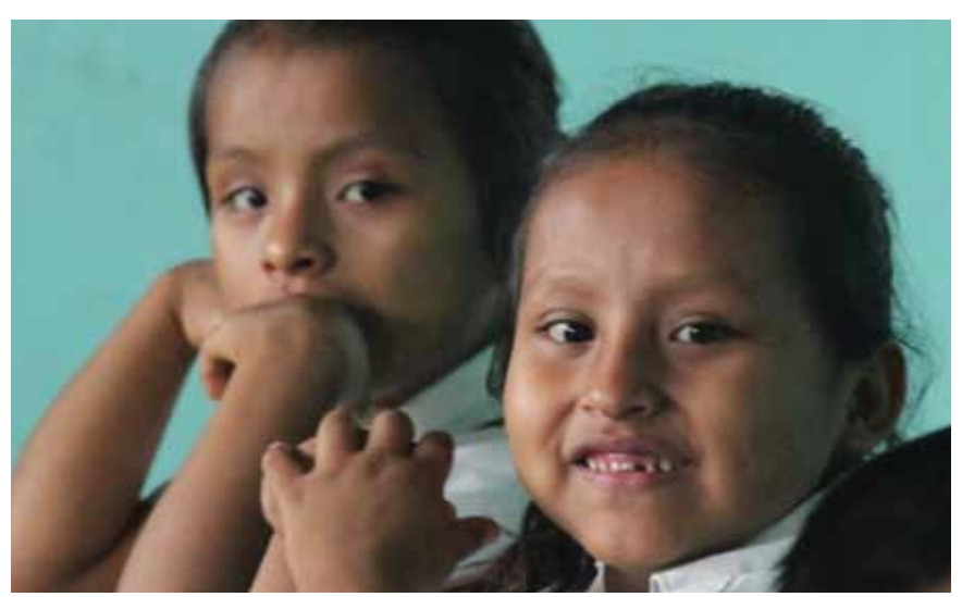
Students in an Active School in Peru

Grade repetition and success in school. In a conventional school, many students repeat a grade. Parents, teachers, and even students accept this as natural. Even more, grade repetition is seen as good and necessary,