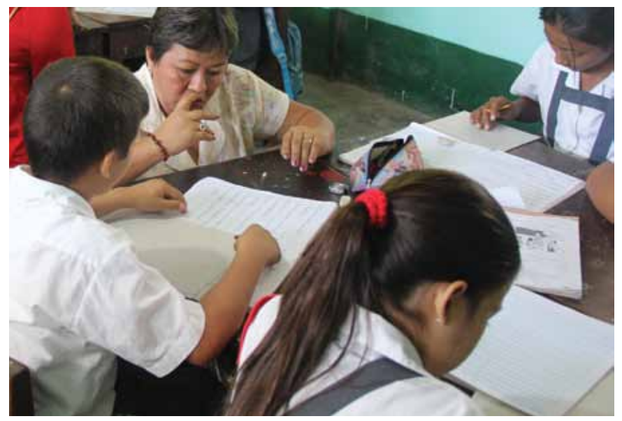
Multi-grade teacher with students in Nicaragua

In the mentoring model, neighboring teachers use their own experiences and work with their colleagues to make concepts and processes more understandable and make change occur more rapidly because it is more compelling, offer more relevant and regular support, provide access to functioning schools for inspiration on how to make it possible, and keep training costs down.