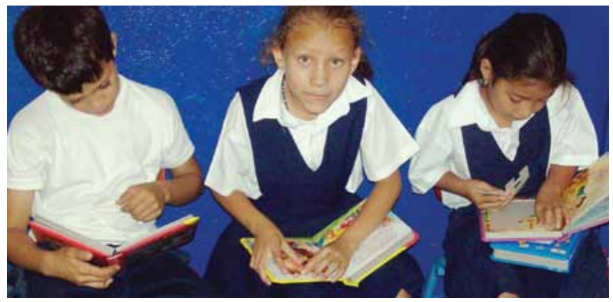
Student reading at an Active School in Nicaragua

they take what they practice and apply it in the community or at home with their families. This is where parents have the opportunity to support the learning process.