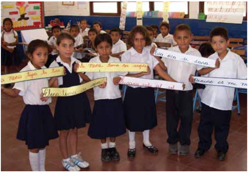
Students using local resources to learn to read and write in Nicaragua

For this to work, teachers are encouraged to study the learning guides and the resources needed for doing the activities. In general, teachers are taught to look at resources they had not considered before with a new perspective and to use them in teaching for investigation, for enriching knowledge, or for solving problems that arise in working through the guides. Teachers need accompaniment to help them see beyond just organizing spaces and materials, to organizing them with resources from their surroundings and using them as strategies for learning by doing, playing, discovering, trying over and over again, and developing and validating hypotheses.